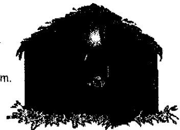
Our Lord and Savior Jesus Christ Was Born

Our school's offering and mission focus this year is to find ways to put "Feet to our Faith" following what we are told in Matthew 25:35-40; helping as many people in as many ways as possible. For December, we will be working on Project: Stranger . For this Project, we will be doing special projects within the classrooms that will help others going through the foster system and/or dealing with family separations/difficulties of some kind. Our offerings will go toward the cost of materials needed to make this possible. You are ALL ALWAYS welcome to join us for our Wednesday Chapel services at 8:00 a.m. For Advent and Lent we will worship at 1:30 p.m.